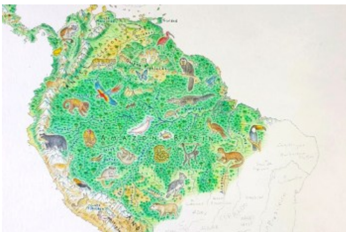
Figure 1: Kottke.org's hand-drawn map of the Wild World.